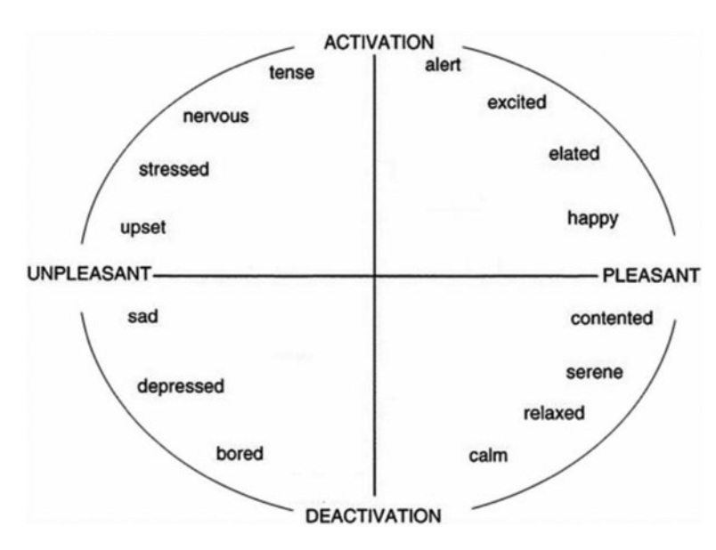
Figure 1. A graphical representation of affect circumplex.